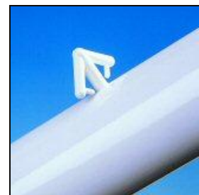
Synthetic Net Hook (UK)