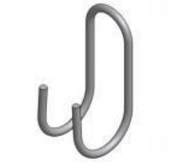
Double J Hook X