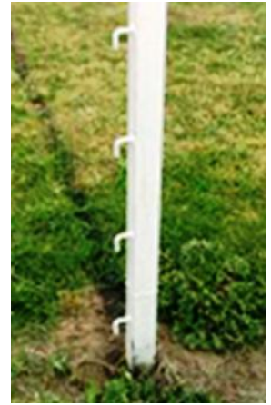
L Hooks on goal X