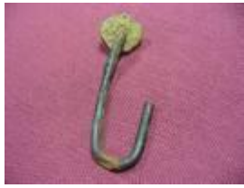
J Hook X