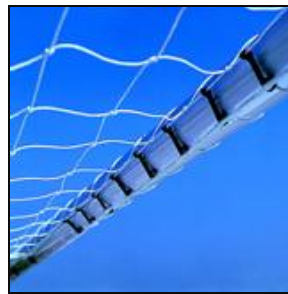
Plastic net clips 1