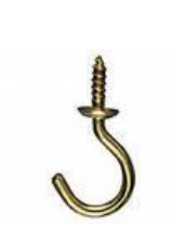
C Hook X

Metal net hooks on goalposts are unsafe and can cause serious injury or death.