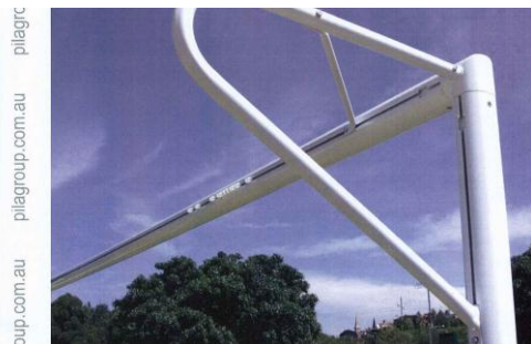
Net Track System (PILA-Aust)