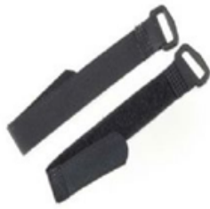
Velcro net straps