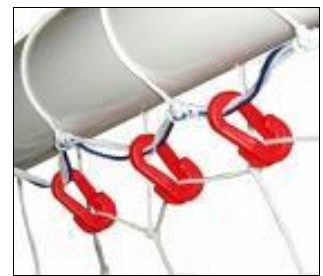
Plastic net clips 2