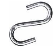
S Hook X